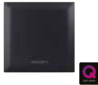
QuietAir QT100 Black Edition T