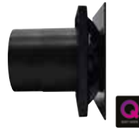
QuietAir QT100 Black Edition HT