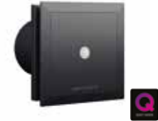
QuietAir QT100 Black Edition MST