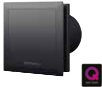
QuietAir QT100 Black Edition B